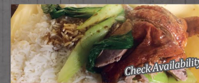
ROAST DUCK ON THE BONE £16.00