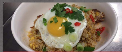
RUNNY EGG FRIED RICE...£12.00