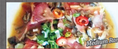
HAO WEI SPECIAL SIRLOIN/RIBEYE...£15.00

If your favourite dish is not on the menu, please ask the Hao Wei team and we will seek to accommodate your request.